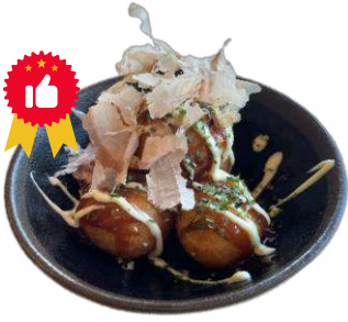
Takoyaki Balls 6.50