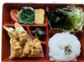
LG Gyoza ( Chicken/Pork/Duck Prawn /Vegetable )