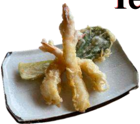
Prawn Tempura 3 Prawns, 1 pakchoi 6.95