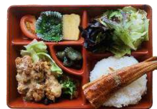
LE Eel & Chicken