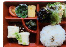
LV Agedashi Tofu