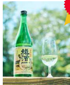
Tarusake Cold Sake Bottle

50ml 4.25 100ml 7.30 Smooth & Fruity 15%