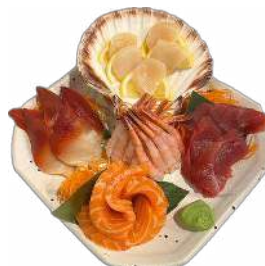
5 types of Sashimi Tuna, Salmon, Scallop Sweet Prawn & Hokki