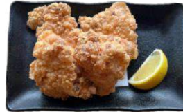
Chicken Karaage 8.95