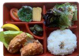
L5 Chicken Karaage