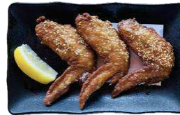
Chicken Wings 6.95