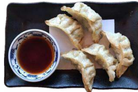
Chicken Gyoza 7.95