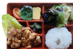
L7 Chicken Teriyaki