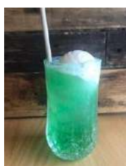
Melon Cream Soda