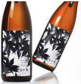
Bijofu Dai Ginjyo

50ml 4.25 100ml 7.30 Smooth & Fruity 15%