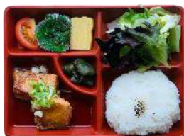
L3 Salmon Teriyaki