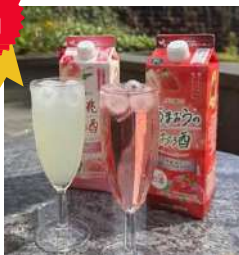
Hinode Sake White peach/Strawberry