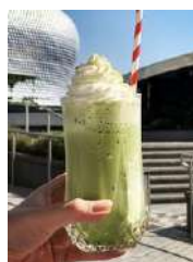
Smoothie Green Tea/Hoji Cha

Coke/Diet Coke/Coke Zero 3.60 J2o Orange & Passionfruit 3.95 J2o Apple & Raspberry 3.95 Fentimans Rose Lemonade 4.25 Fentimans Ginger Beer 4.25 Appletiser 4.25 Orange/Apple Juice 2.95 Still/Sparkling Water 3.00