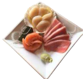
3 types of Sashimi Tuna, Salmon & Scallop