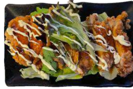
Chicken Teriyaki 8.95