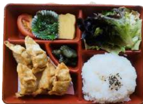
LG Gyoza (Chicken/Pork/Duck) Prawn /Vegetable