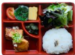
L3 Salmon Teriyaki