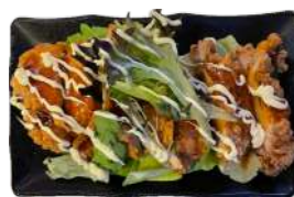
Chicken Teriyaki £8.50