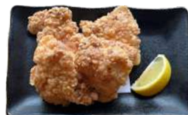
Chicken Karaage £8.50