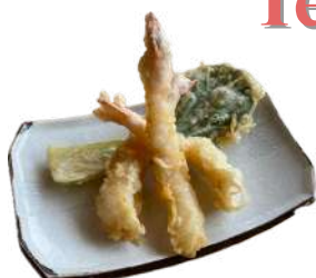
Prawn Tempura 3 Prawns, 1 pakchoi £6.50