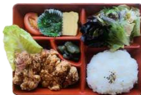
L7 Chicken Teriyaki