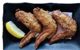
Chicken Wings £6.95