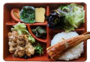
LE Eel & Chicken