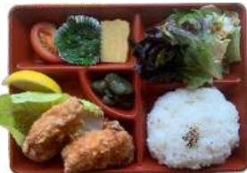
L5 Chicken Karaage