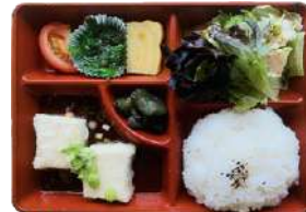
LV Agedashi Tofu