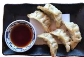
Chicken Gyoza £7.50