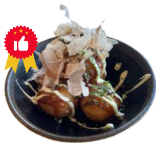
Takoyaki Balls £5.95